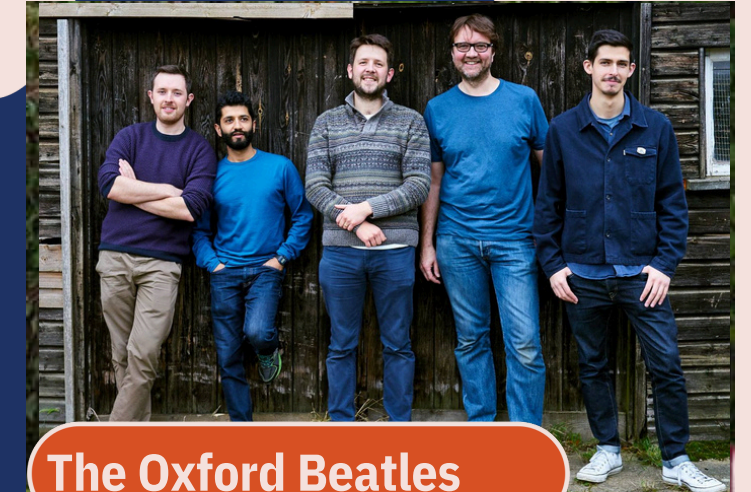
The Oxford Beatles