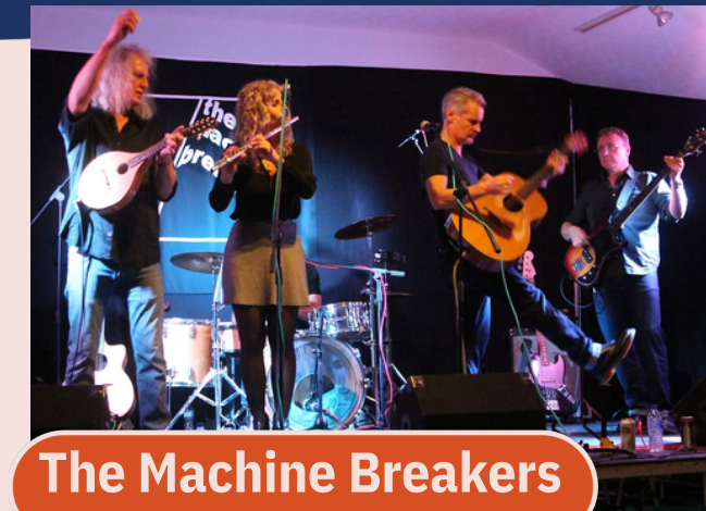
The Machine Breakers