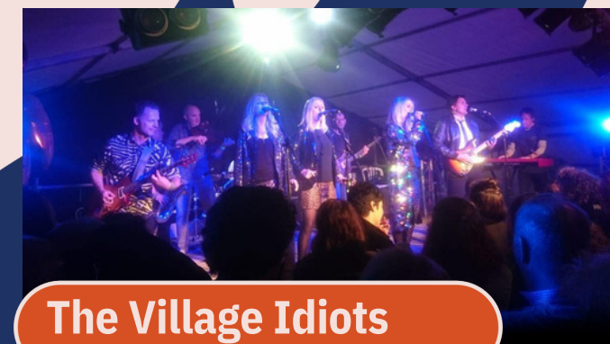
The Village Idiots